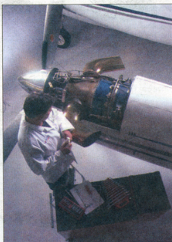
The new turbine engine shop will specialize in PT6A and JT15D engines.

To help kick-start the acquisition of new customers, Western Skyways has introduced its Buddy