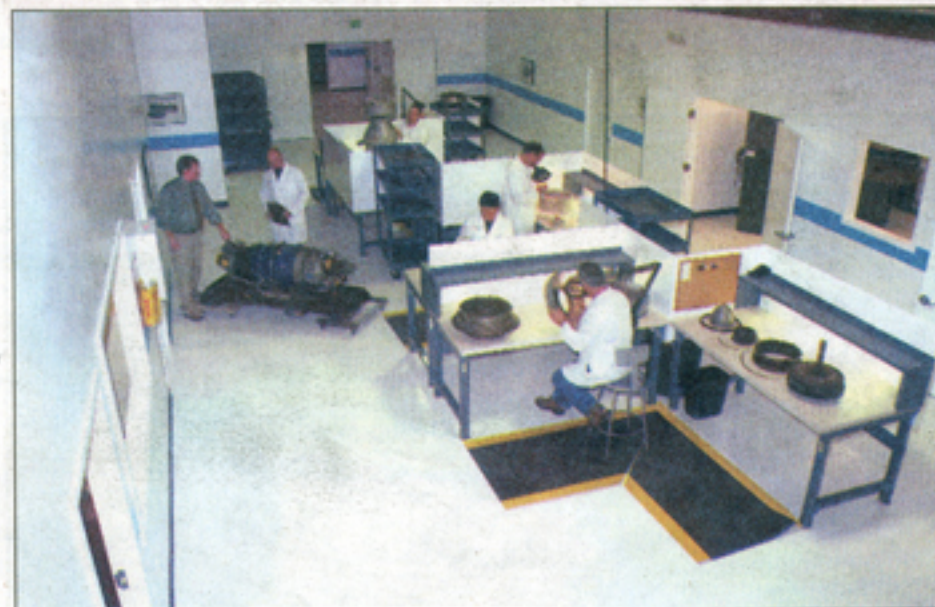
Western Skyways' turbine engine shop features state-of-the-art equipment.